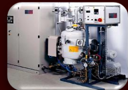
Sample Images. Actual build shall vary depend on customization meeting customer's requirement.